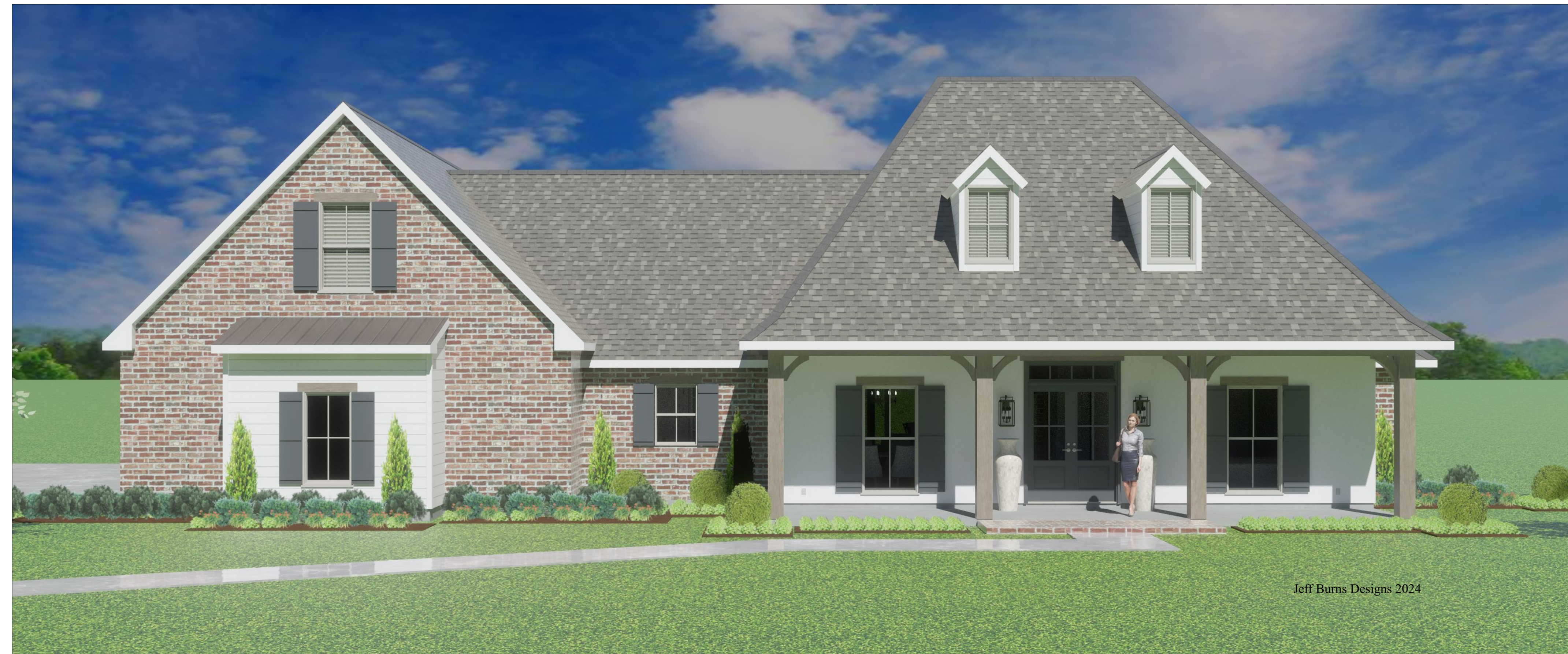
Jeff Burns Designs 2024

EMAIL: ContactJeffBurnsDesigns@gmail.com