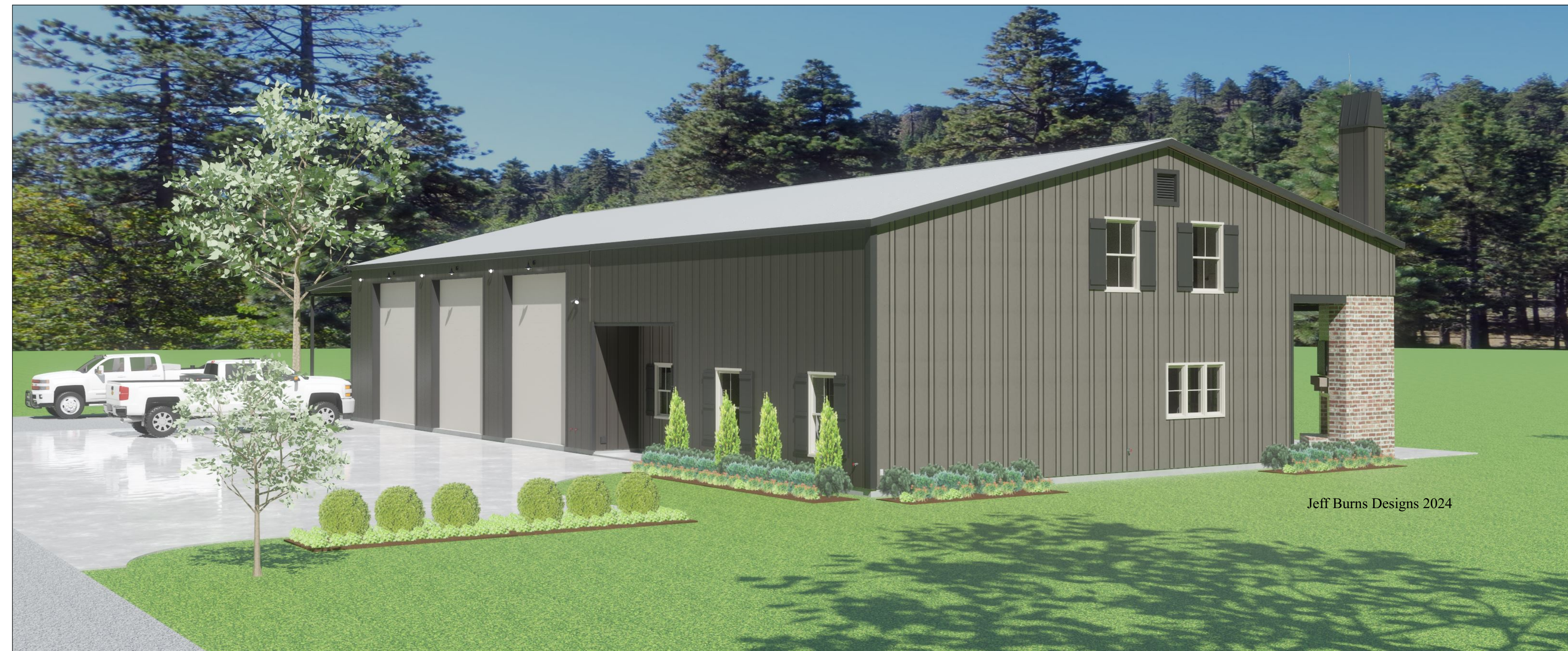
Jeff Burns Designs 2024