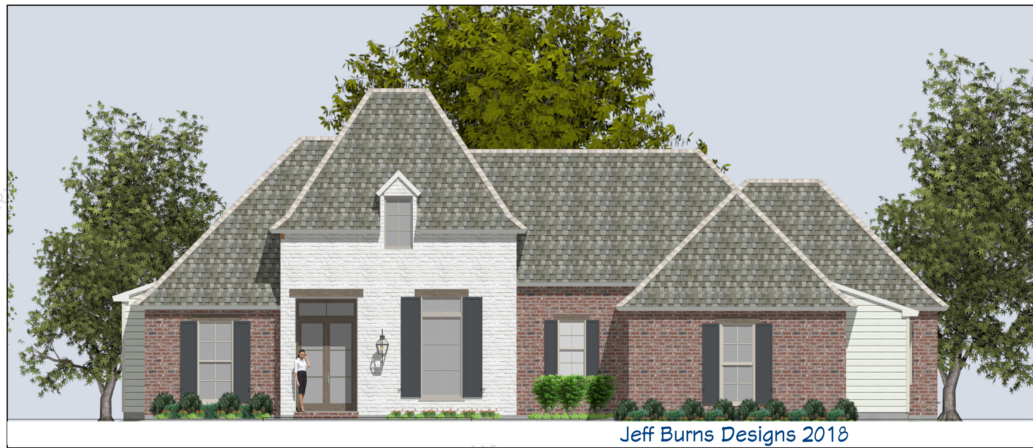
Jeff Burns Designs 2018