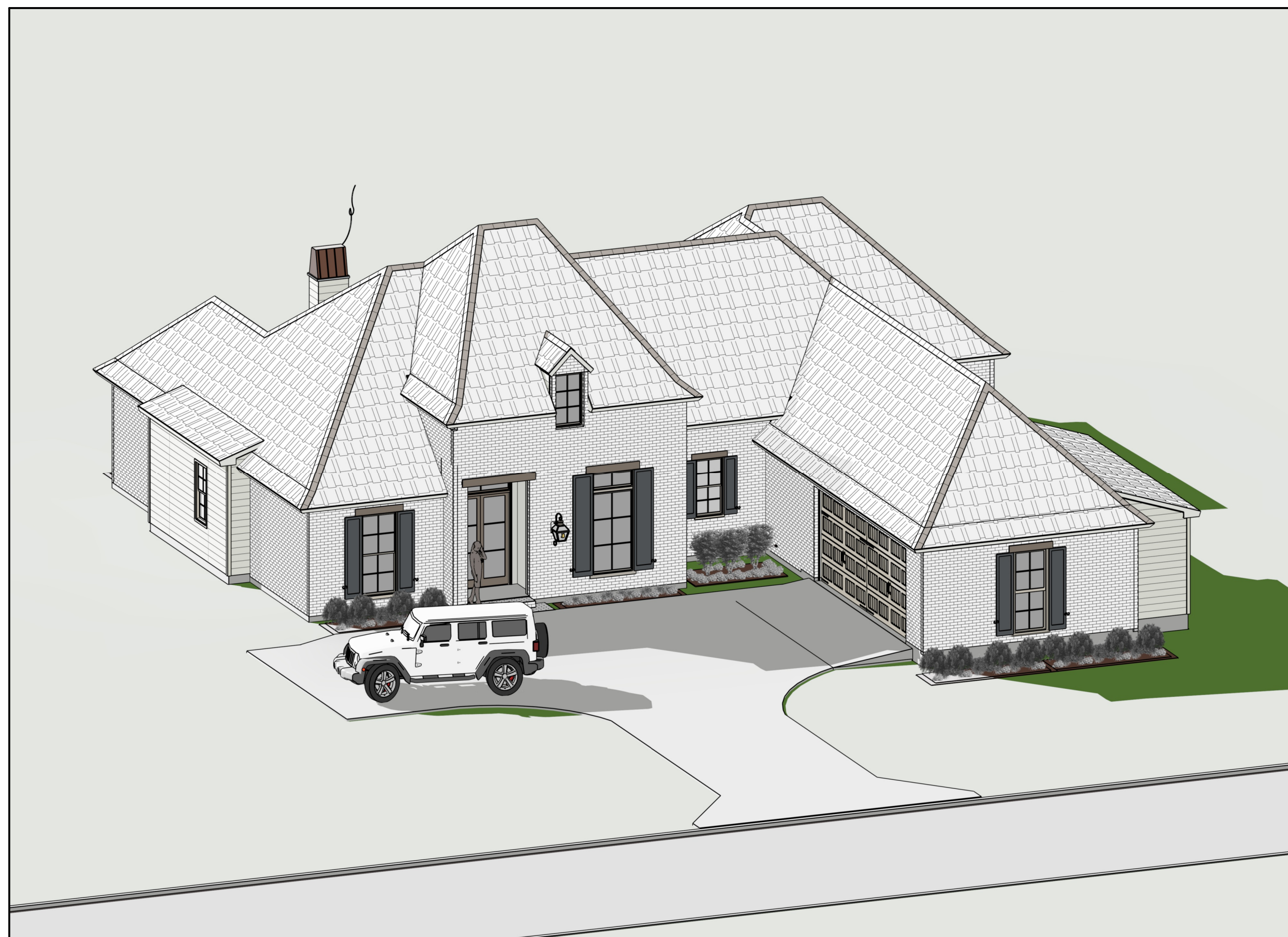
Front 3D View